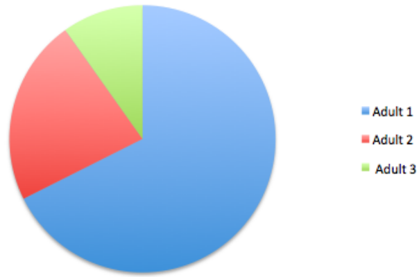
Table 2. Number of Interruptions Post-Intervention