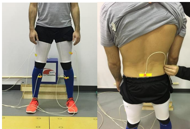
Figure 1. Sensor placement over distal vastus lateralis, medial tibial shaft, and S2 level of the sacrum.

posterior to anterior for the x-axis, inferior to superior for the y-axis, and medial to lateral for the z-axis.