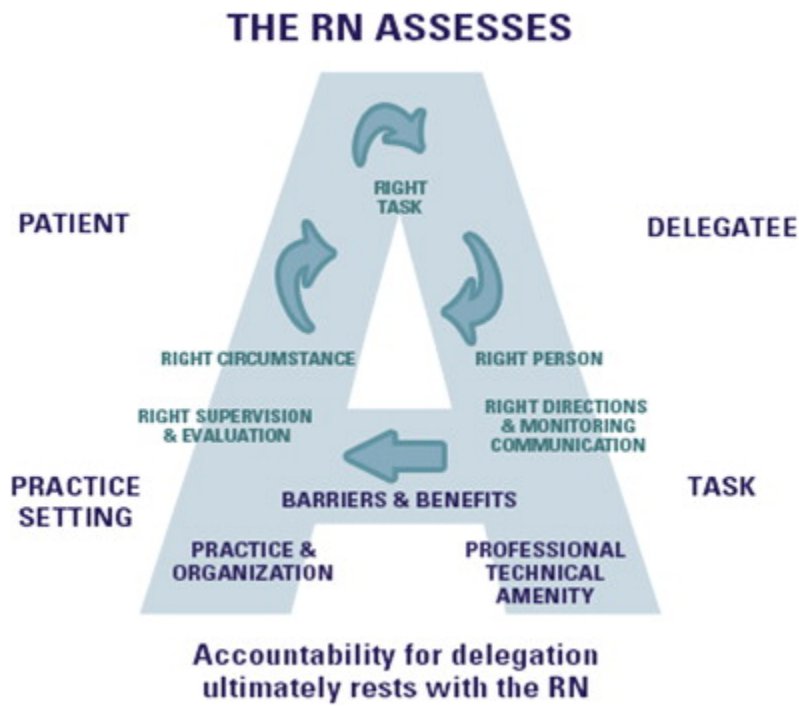
FIGURE 1: ANA Delegation Model

ANA, Principles for Delegation, Delegation Model, 2006, p.13